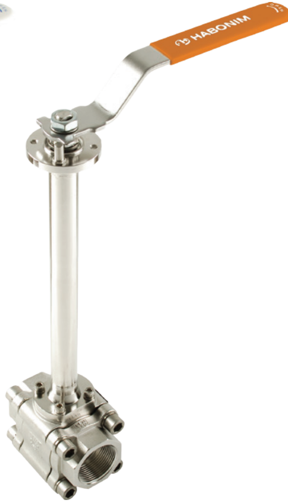
Cryogenic HermetiX™ fire safe